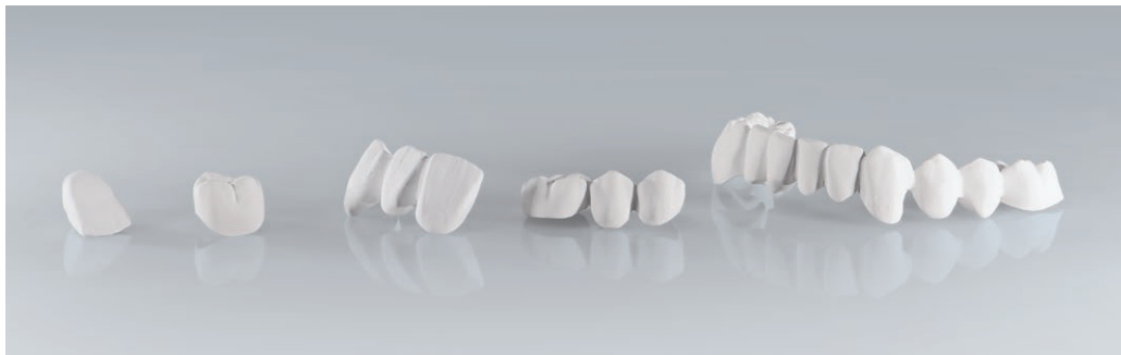
Single-unit restoration up to multi-unit bridges