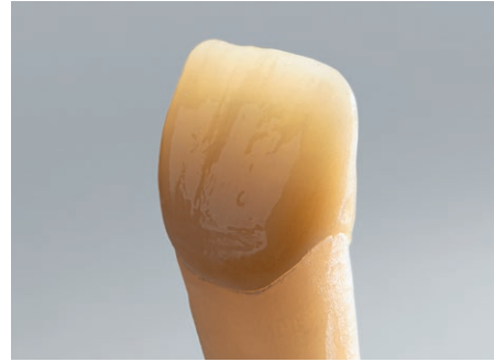
Outstanding esthetic properties