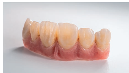
NexxZr+ white individually infiltrated and veneered