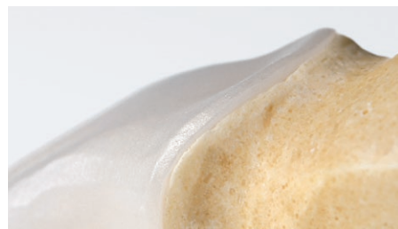
Very good fitting accuracy