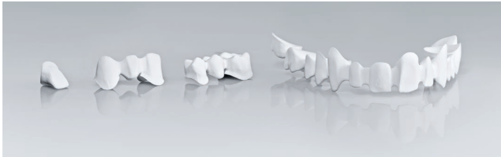
Wide range of indications

Single tooth to multi-unit bridge frameworks