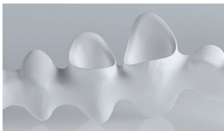
Excellent milling results

Excellent milling properties, accuracy of fit and edge stability